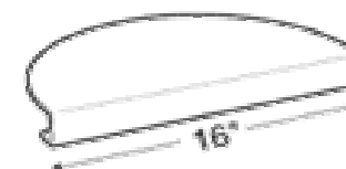
Corner Sleeve DE200