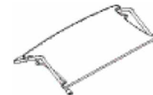
Angle FootRester #210

Matching Funds: please provide email address/fax # for proforma invoice request: