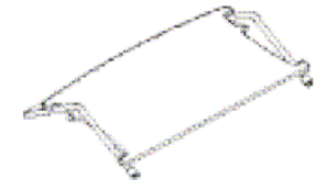
Angle FootRester #210

*Prices include delivery but do not include tax